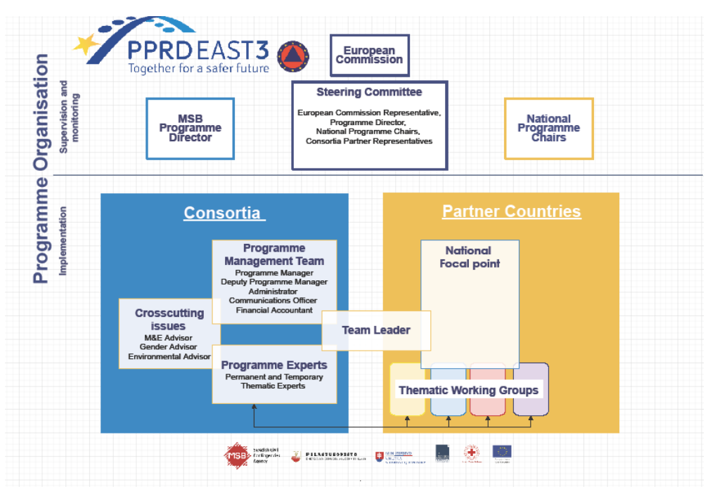
Exhibit 2: PPRD East 3 Governance framework

Each partner country has nominated one National Programme Chair to lead the programme at the national level, and National Focal Point to plan, coordinate, and facilitate the programme implementation at the national level.